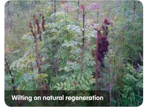
Wilting on natural regeneration

A balanced approach should be taken to tree safety management – advice is available at forestry.gov.uk/safetreemanagement . Where public access exists close to infected trees, use site notices to let people know about attempts to minimise the spread of the disease, and to encourage them to support the biosecurity measures in place. forestry.gov.uk/biosecurity-visitoradvice