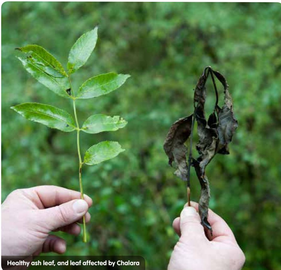
Healthy ash leaf, and leaf affected by Chalara

Although deadwood can sometimes present a hazard, it is also a vital ecological asset. Many species require deadwood for the whole or part of their life cycles, and those species are in turn part of the food chain for many other species.