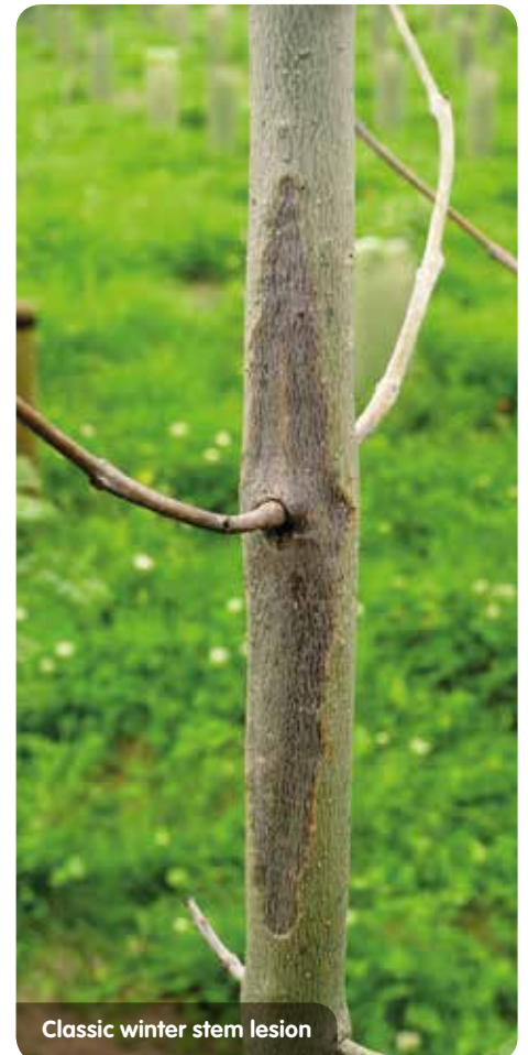
Classic winter stem lesion