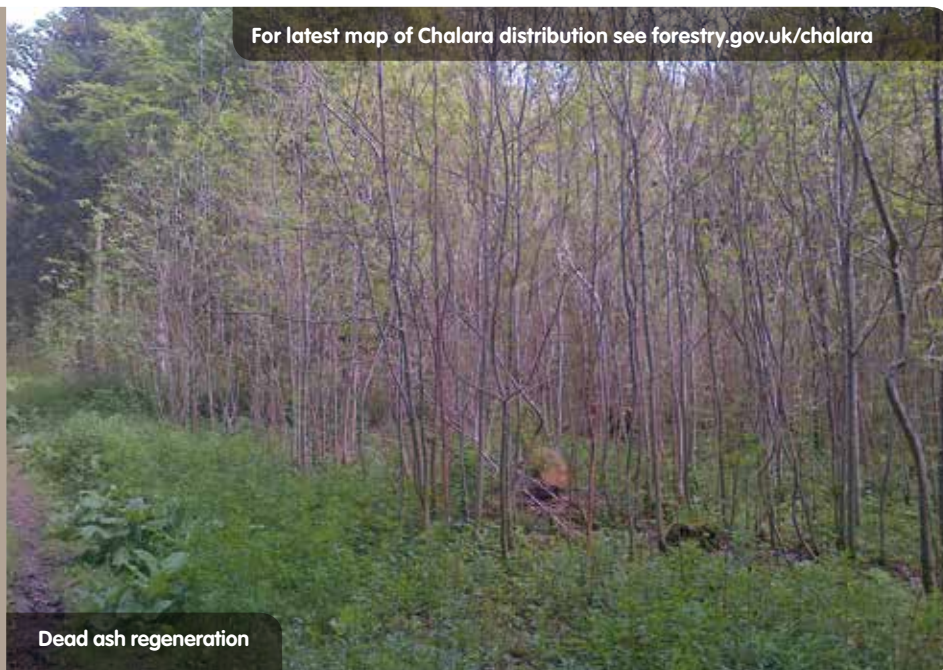
Dead ash regeneration

For latest map of Chalara distribution see forestry.gov.uk/chalara