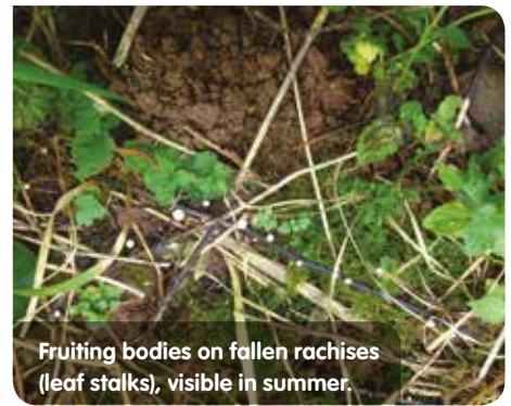
Fruiting bodies on fallen rachises (leaf stalks), visible in summer.