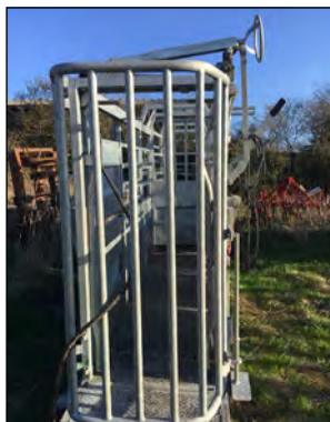
Can't see whole item ❌

Here is an example of what photographs should and shouldn't look like:-