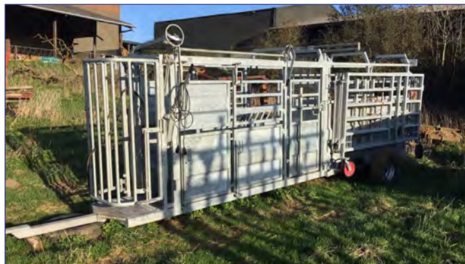
Right distance to see whole item ✅