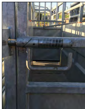
Too close to item ❌